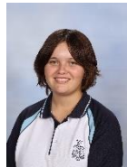
Xena-Delta Whitby SPS Athletics Carnival