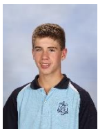
Will Foley Sportsman Encouragement Award