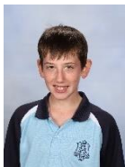
Wiley Crisp Bhima Classroom

The following students have been awarded outstanding growth in their SAIL classroom