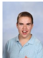
Leeton Whitla Arrowfield Classroom